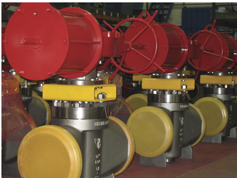
High-pressure plug valves await shipping at an MTS Valves warehouse in the north of Spain.

Though this area can provide for its water needs without desalination technology, nevertheless a number of companies have specialized in meeting the needs of desalination. Desalinating seawater involves particular engineering challenges, including dealing with the high corrosivity of the water and the extremely high pressure needed to force the water through the membrane.