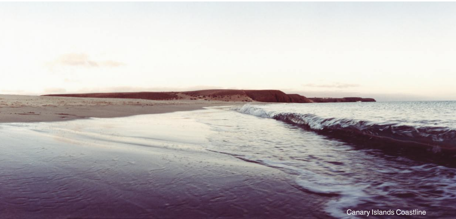
Canary Islands Coastline